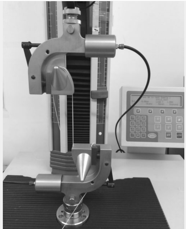
Tensile test of Durus S500 filament according to EN

However, the shorter the molecular chains, the more brittle the fibre becomes. Less elongation has a positive effect on the modulus of the fibre. So while the fibre is degrading it has little effect on the modulus of the fibre.