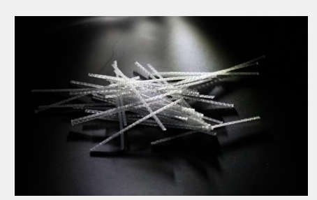
DURUS $400 Synthetic Macro Fibre Replaces conventional welded steel mesh reinforcement