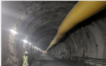
One of the tunnel portals