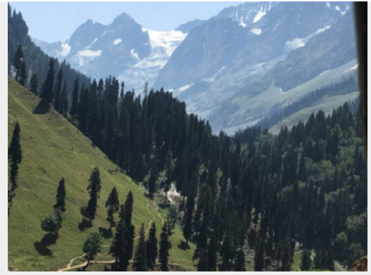
Working on a difficult geography to ensure winter supplies