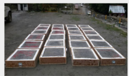
EFNARC sample preparation for testing

wastage of fibres on site during batching, handling and transportation.