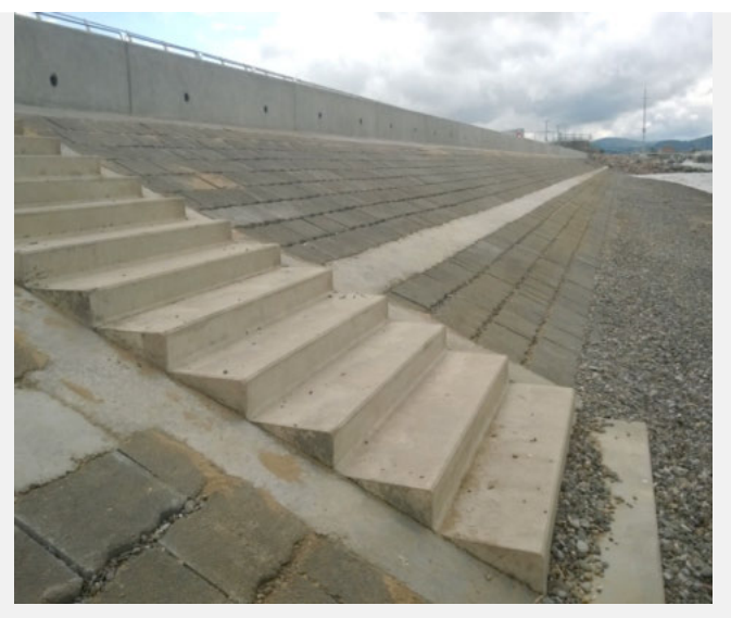
Fibre was used in the construction of the steps too.