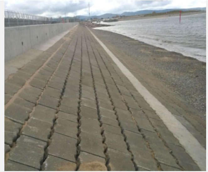
Linked concrete blocking surrounded by C40 concrete containing 4 kg Durus S400. Protecting the land from coastal attack and erosion.