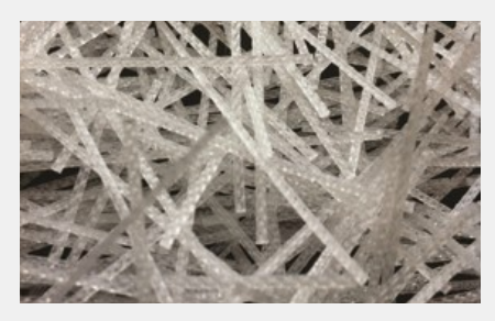
Macro Synthetic Fibre DURUS $400 Dosage of 5kg/m³ to provide protection from shrinkage cracking and enhance the durability of the 50mm screed topping.