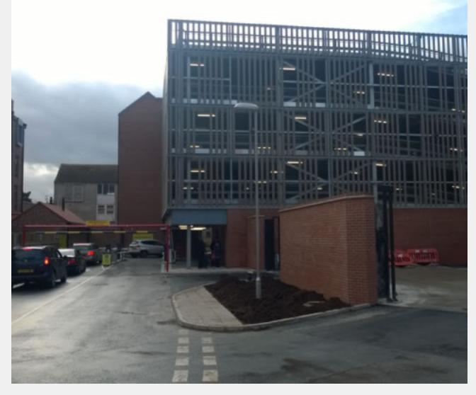
Entrance to the 5-storey Multi–Storey Car Park in Beverley historic town centre.