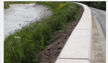
River & sea defences