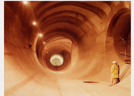
Tunnel segments installed