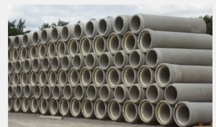
Pipes and sectional elements