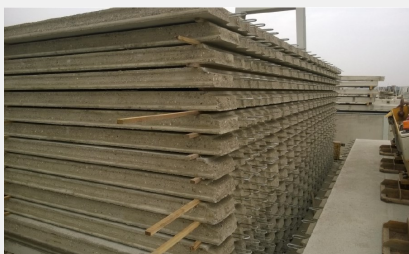
Car park elements