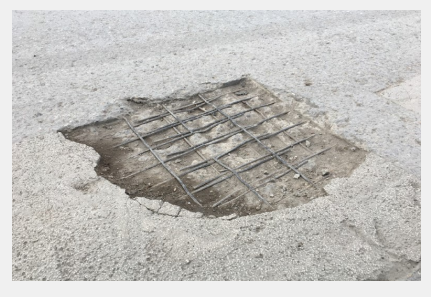
Post Failure Serviceability