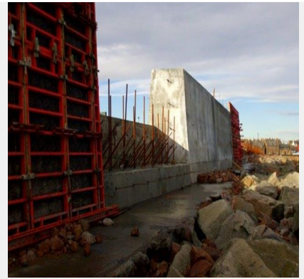
Peterhead Sea Defence