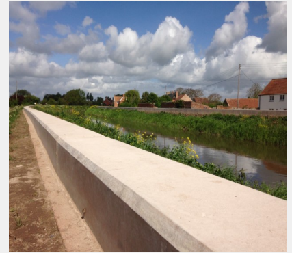
River flood defence