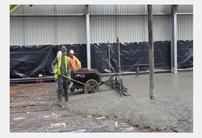
A laser screed could be used continuously without the need for breaks in installation to fix a top layer of conventional steel mesh reinforcement.