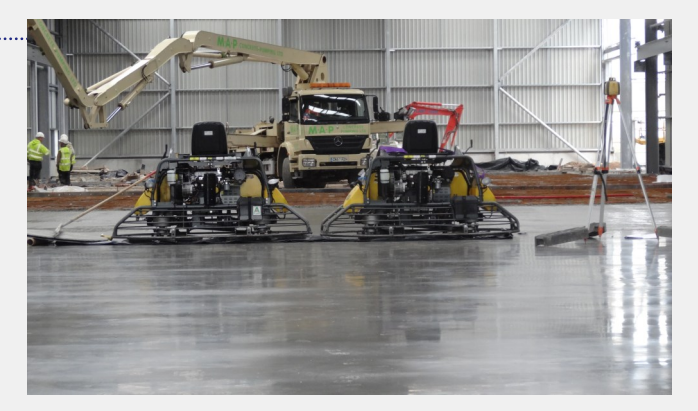
A high quality power float finish was achieved using DURUS $400 Synthetic Macro Fibres.