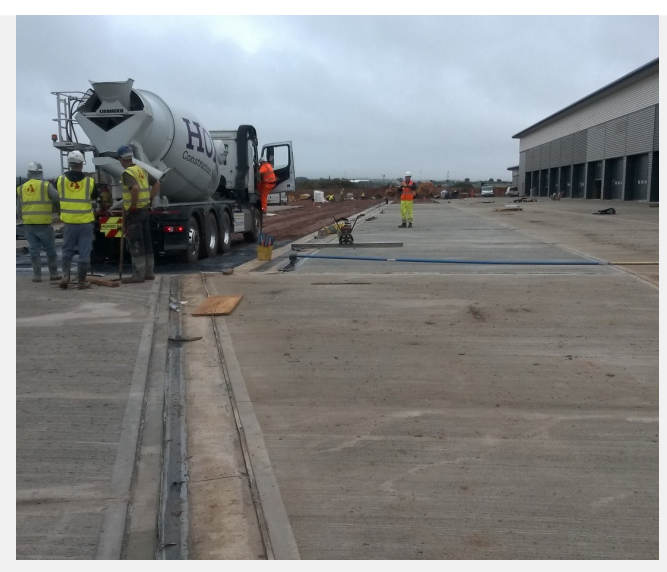
As the reinforcement is dosed into the concrete during batching, the mixer truck can discharge directly into the formwork.