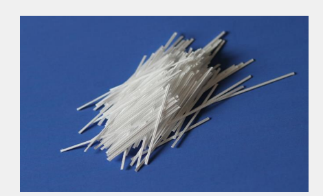
DURUS S400 Synthetic Macro Fibre Replaces conventional steel mesh reinforcement