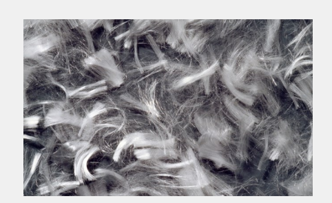
Fibrin XT Monofilament Micro Fibre Improves the durability of the concrete and gives frost protection in lieu of AEA