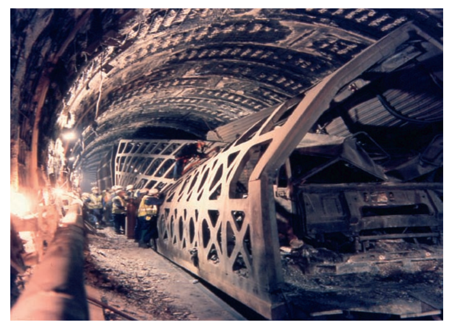
Figure 2: Damage in the Channel Tunnel, 1996.

As a consequence of the above mechanisms, any structural steel in the concrete must be carefully positioned so as to avoid exposure to high temperatures, as at 700°C the load-carrying capacity of steel is reduced to approximately 20% of its value at normal temperatures.