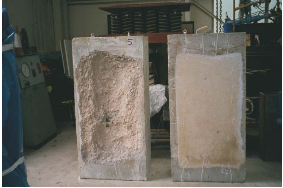
Fig 2 Samples After Test

This confirmed the evidence obtained from the initial test program.